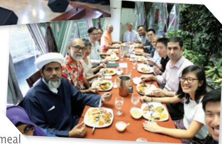
Bonding and connecting over a meal after the Hymn Festival