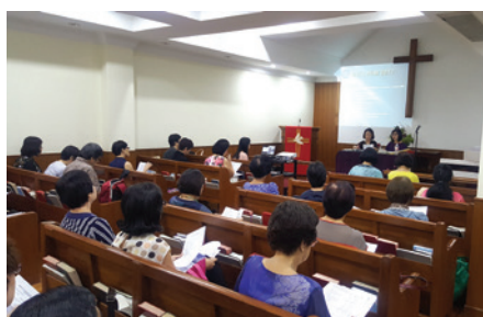
The AGM in progress