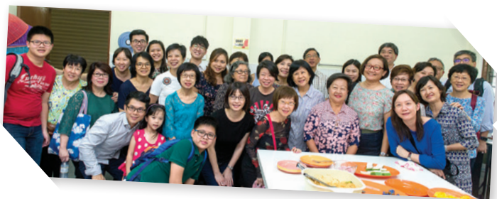
The choir bonding over Penang delicacies