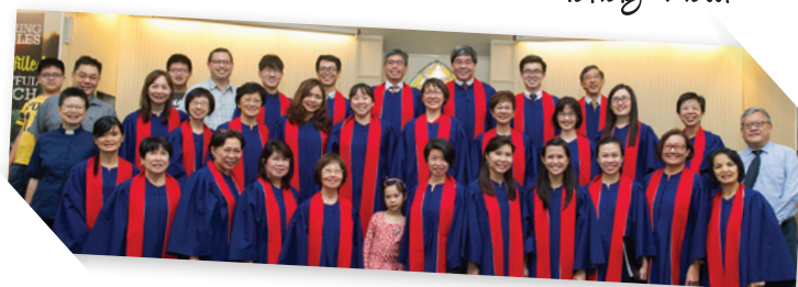
The KKMC Combined Choir singing at the special Hymn Festival held to celebrate the 60th anniversary of Trinity Methodist Church, Penang