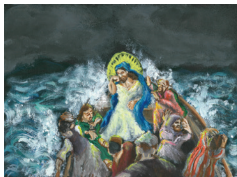
Jesus in the Boat

I did nine pieces of artwork to illustrate different parts of The Tale of the Three Trees. These illustrations were used as the backdrops for the cantata.